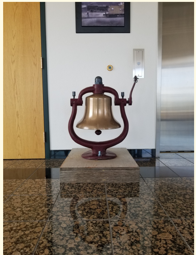
Engine #70 steam engine bell

- Ashley Page, CDM Education & Exhibits Assistant